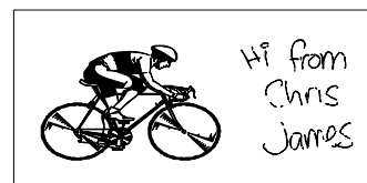
Sample image #2